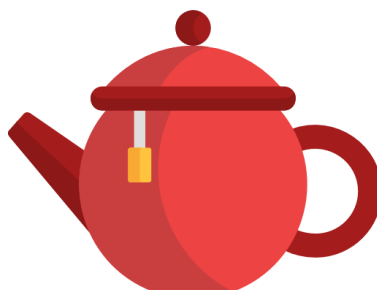
Figure 1: "teapot" designed by Freepik from Flaticon

https://www.flaticon.com/free-icons/teapot